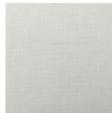
Oyster Pearl Gray