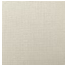
Oyster Pearl Gray