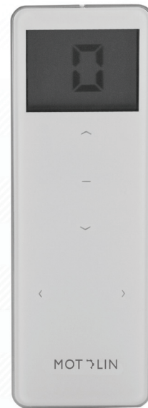
SKU# ML-653RS (White) ML-653RS-B (Black)