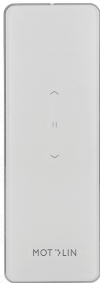
SKU# ML-651RS (White) ML-651RS-B (Black)

Motor compatibility: ML-250B, ML-350B, ML-350F