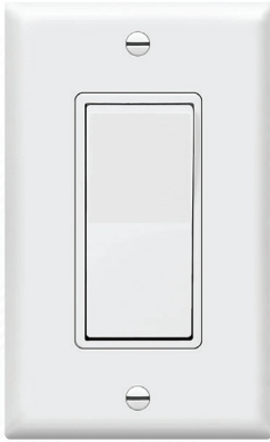
Single Roller Shade