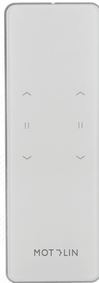
SKU# ML-652RS (White) ML-652RS-B (Black)